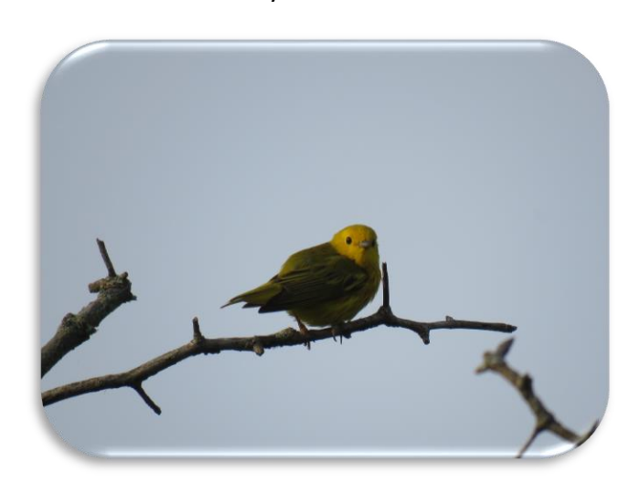
Yellow Warbler at Leduc Property Dunvegan, North Glengarry