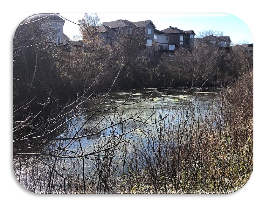
Radison Stormwater management facility Russell Township