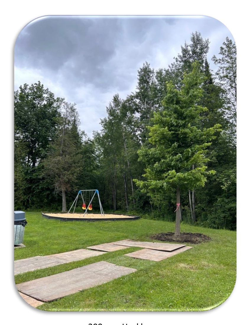
200 mm Hackberry, Parc Bellevue, Rockland