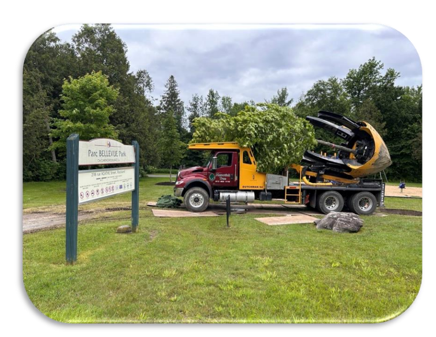
150 mm Sugar Maple to be planted, Parc Bellevue, Rockland