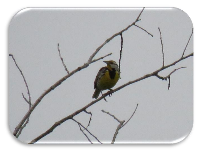
Eastern Meadowlark at GSI private property City of Ottawa