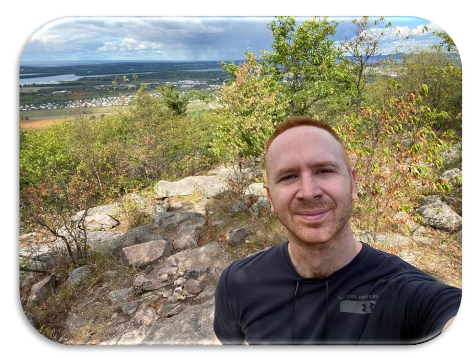
Hiking Mount Rigaud, Quebec