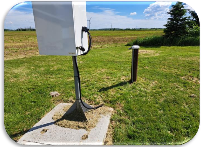
Before and After - Berwick PGMN Well Site